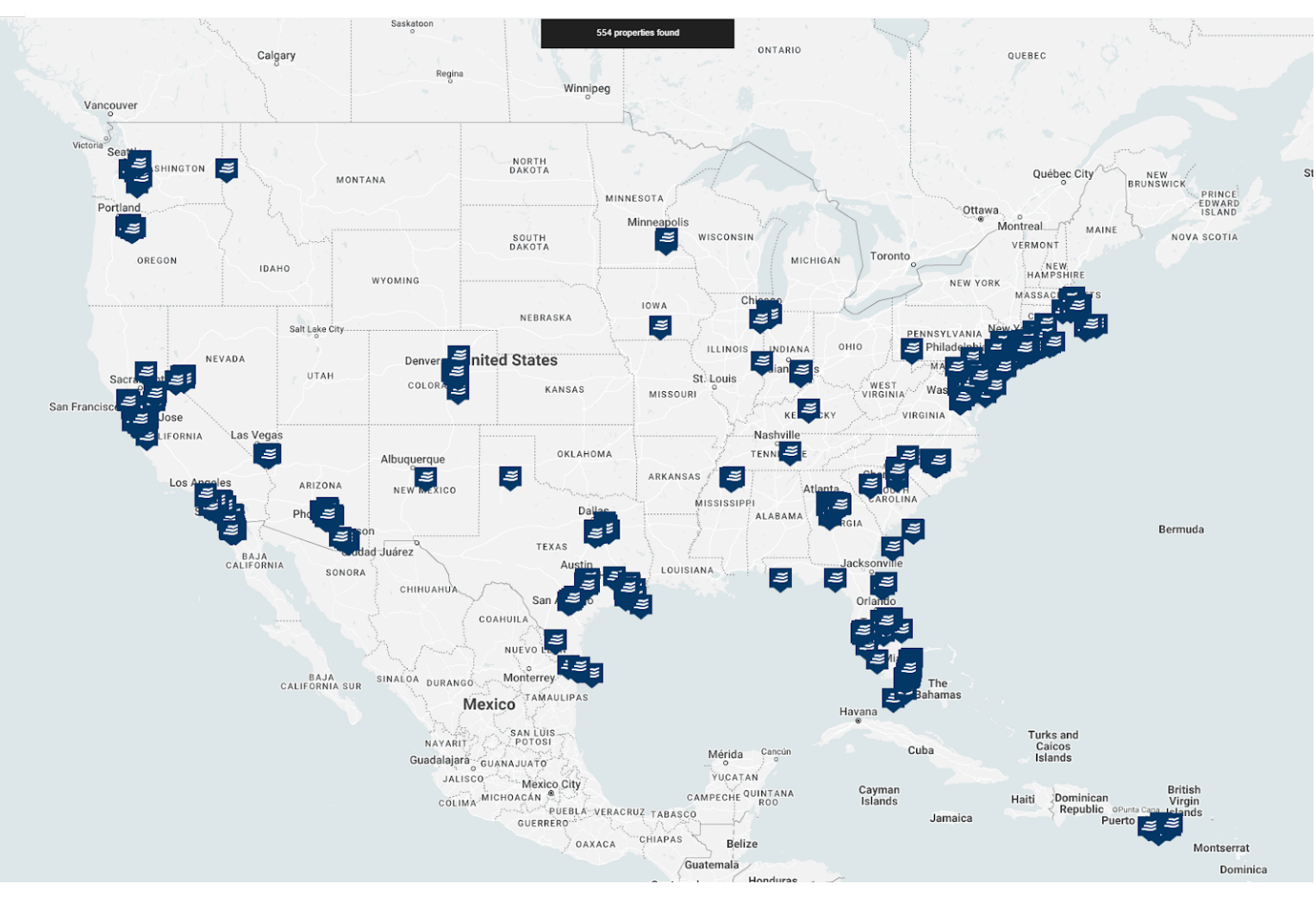
Each blue pin represents one of Kimco's properties.

On the flip side, New York City REIT (NYC) owns a portfolio of commercial properties in New York City.